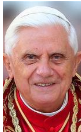
Pope Benedict XVI